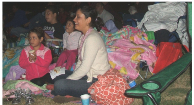
Bottom Right: Family Enjoying CARS 1 at Sept 3rd Movie on the Green at 20th & Daisy